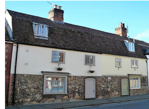
26 & 28 Mustow Street (above) restored in 1981 and 1-4 Shaker's Lane (below), restored in 1984